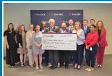
Bank OZK, Carrollton, GA