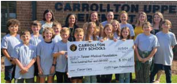
Trojan Ambassador Club at Carrollton Upper Elementary

Thank you to our donors and community partners who make our work possible! Your support has created impact in our community that enhances wellness every day and will touch lives for generations to come.