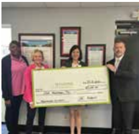
JAC Products (Heard County)