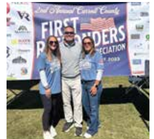
Caliber 1 Construction First Responders Appreciation