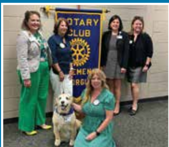
Bremen Rotary Club Presentation