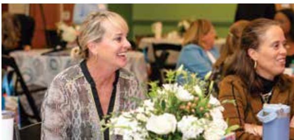
Tanner Health SHE Conference