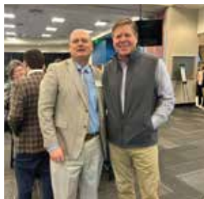
Tanner Health Community Breakfast