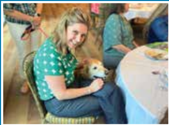
Tanner Ladies Luncheon Featured Guest Dog Paris