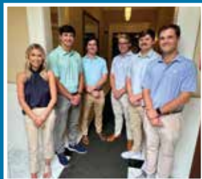
Stratus Property Group