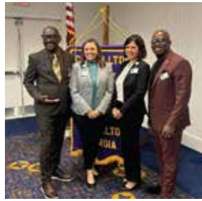
Carrollton Lions Club