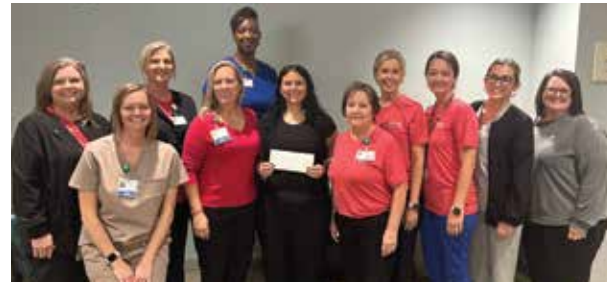
Haralson County High School Beta Club Supporting Mammogram Assistance