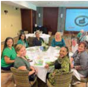
May Ladies Luncheon