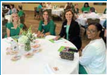
Tanner Ladies Luncheon Attendees

In memory of Paris, a Remarkable Paws Therapy Dog. "Dogs and angels are not very far apart." - Charles Bukowski