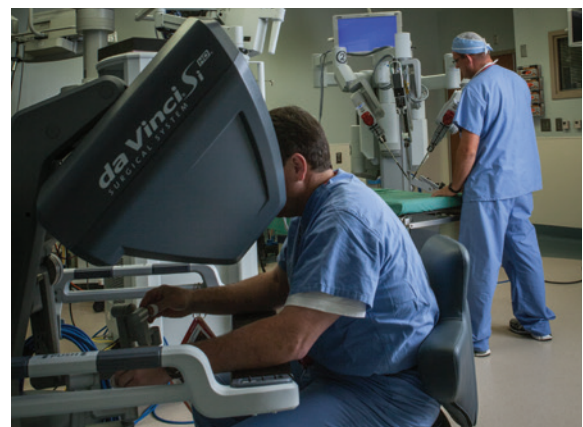
Robotic-assisted surgical options at Tanner allow physicians to work with smaller incisions and greater dexterity than ever before.

Follow all preoperative instructions to avoid health risks and potential rescheduling of your surgery. These guidelines are designed to minimize health risks and ensure the best possible outcomes. By following these steps, you help us create a safe and efficient surgical experience. Your cooperation is greatly appreciated, and we are committed to providing you with the highest quality of care. Thank you for entrusting us with your health and well-being.