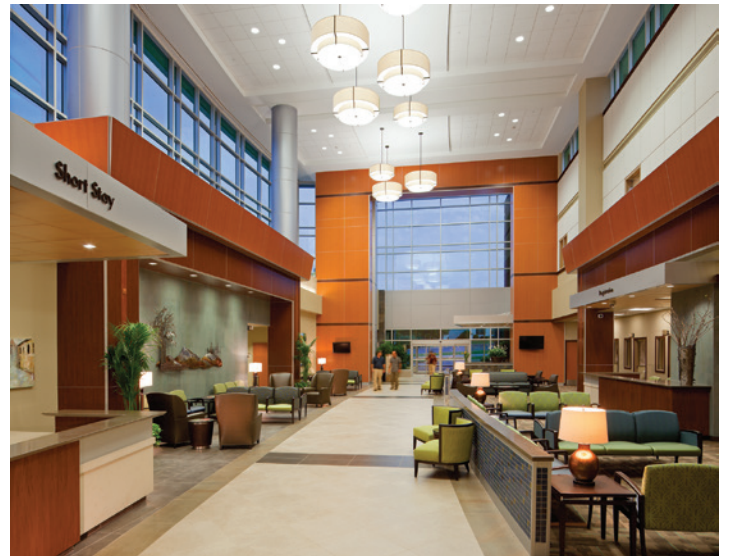
Short Stay at Tanner Medical Center/Carrollton

Our goal is to keep you well-informed about every step of your procedure. If you have any questions or concerns, please contact the number for your surgery center at the beginning of this booklet or ask a member of our medical staff.