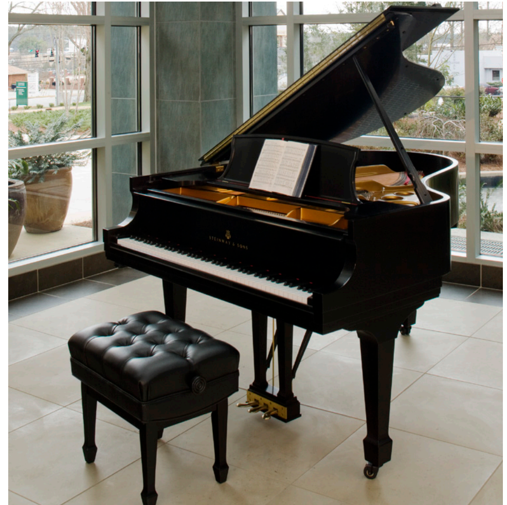
Steinway piano located in the John H. Burson III, MD, Atrium